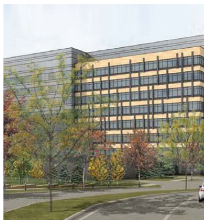
City West: New and existing office space including UnitedHealth Group's campus.