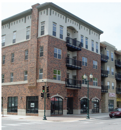
Marketplace Lofts: Retail and residential with a historic aesthetic on Main Street in downtown Hopkins.