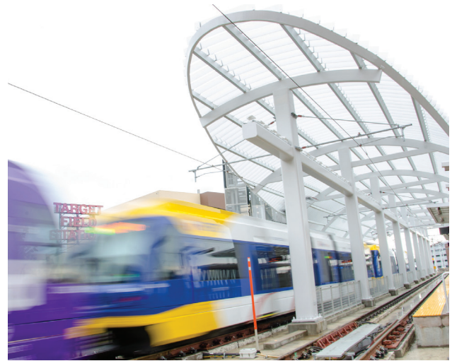
Target Field Station