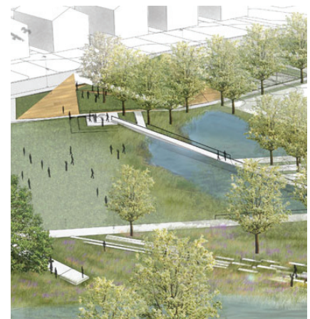
Blake station area: Existing residential and commercial with a park redesign and expansion underway.